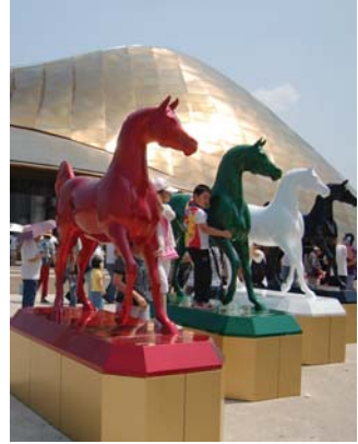
Shanghai 2010 – UAE Pavilion.