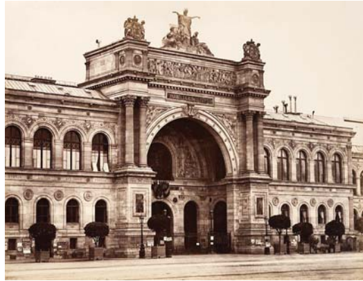
Paris 1855 – Palais de l'industrie.