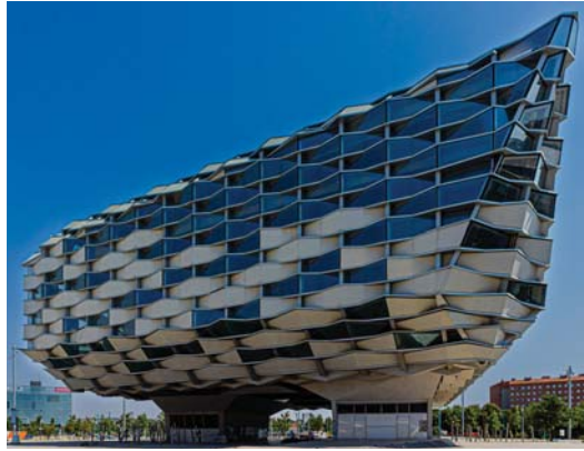
Zaragoza 2008 – Aragón Pavilion.