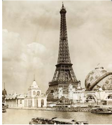
Paris 1889 – Eiffel Tower.