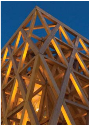
Milan 2015 – Chile Pavilion.