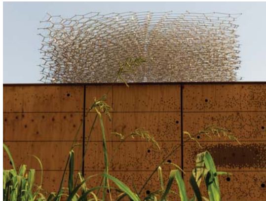
Milan 2015 – UK Pavilion.