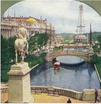
Louisiana 1904 – East Lagoon.