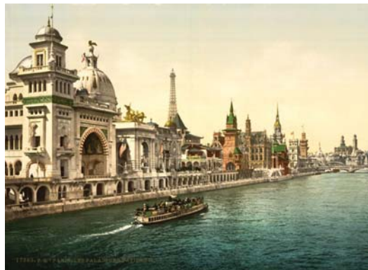
Paris 1900 – Palais des Nations.