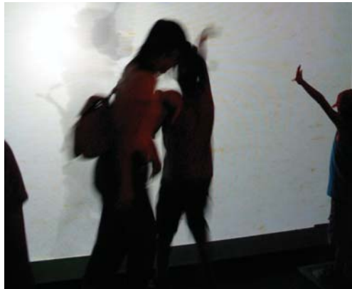
Aichi 2005 – Korea Pavilion.