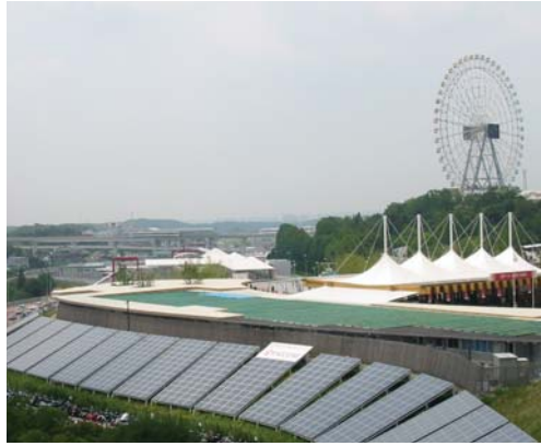
Aichi 2005 – Solar panels.