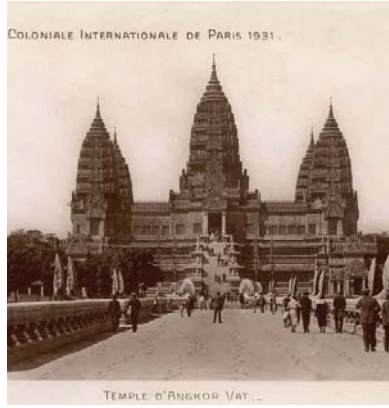
Paris 1931 – Temple Angkor Wat.