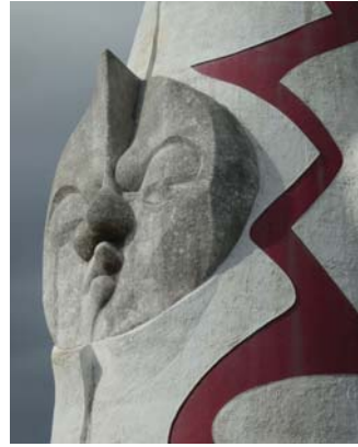
Osaka 1970 – Tower of Sun.