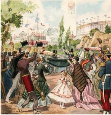
Paris 1867 – Expo life.